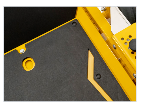
Standard Rubber Floor Mat