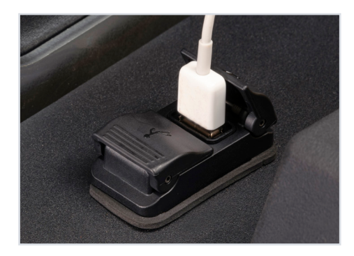
Standard Dual USB Port